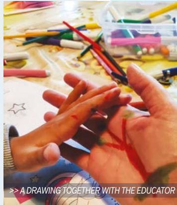
>> A DRAWING TOGETHER WITH THE EDUCATOR